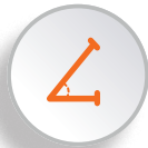
Slope 12° to 50°