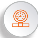
Weight 2.8 to 3.7 kg/m 2