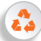
Material PP - Aluminium Stainless steel (100% Recyclable)