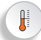
Temperature range -30°C to 100°C